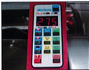
Touch Pad Controls