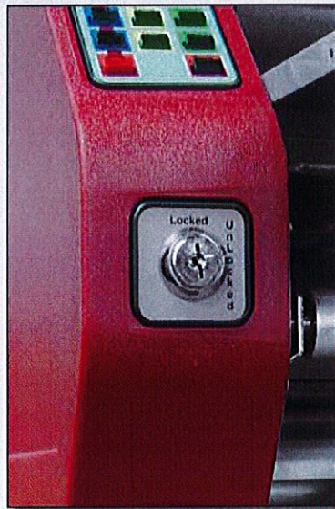
Key Switch Prevents Unauthorized Users